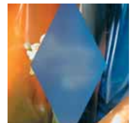
Custom Blue Diamond