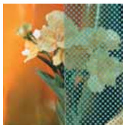
1/8" Dots, 1/4" on Center on Evergreen Glass