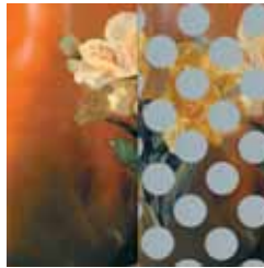
3/4" Dots, 1 1/2" on Center