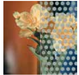
1/4" Dots, 3/8" on Center