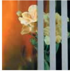
1/2" Lines, 1" on Center Beige Frit on Evergreen Glass