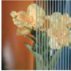
1/16" Lines, 3/16" on Center