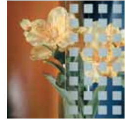
3/8" Squares, 5/8" on Center