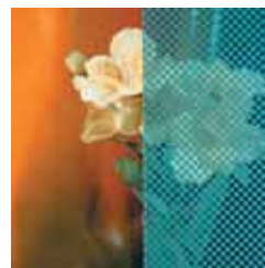
1/8" Dots, on Blue Green Glass