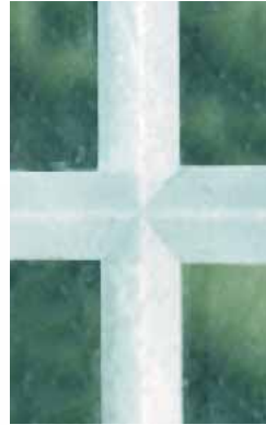
3/8 Frosted V-Groove