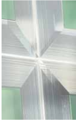
3/4 Polished V-Groove