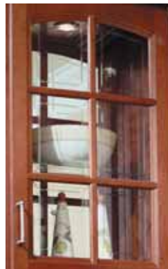
V-Grooved Glass, Bevel Pattern

Any pattern can be designed by engraving a groove in the surface of the glass. Different profiles and groove widths are available and can be duplicated time after time by our state of the art CNC grooving equipment. Straight lines and shape designs can be created on many different glass substrates, including mirror. Combine this process with the many other Arch Deco Glass® products and just imagine what you can do with decorative glass.