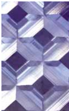
3/8 Polished V-Groove