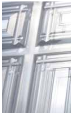
Polished Muntin Groove