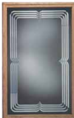
Custom border design on mirror