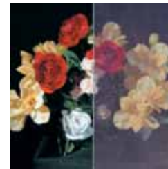
FA930 Metallic Ingot