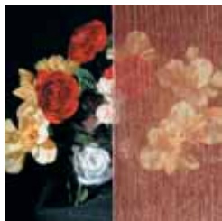
FA910 Burgundy Gold